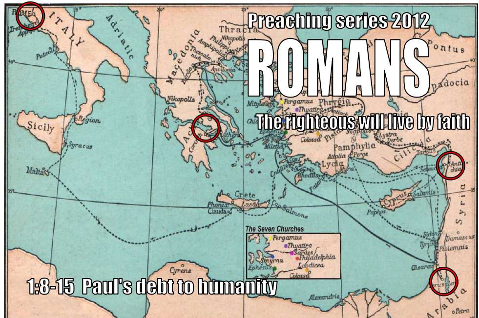
Paul set out on his missionary journeys from his headquarters in Antioch (right). He wrote to the Christians in Rome (left) from Corinth (centre) in 57AD. Jerusalem is marked out to the lower right.